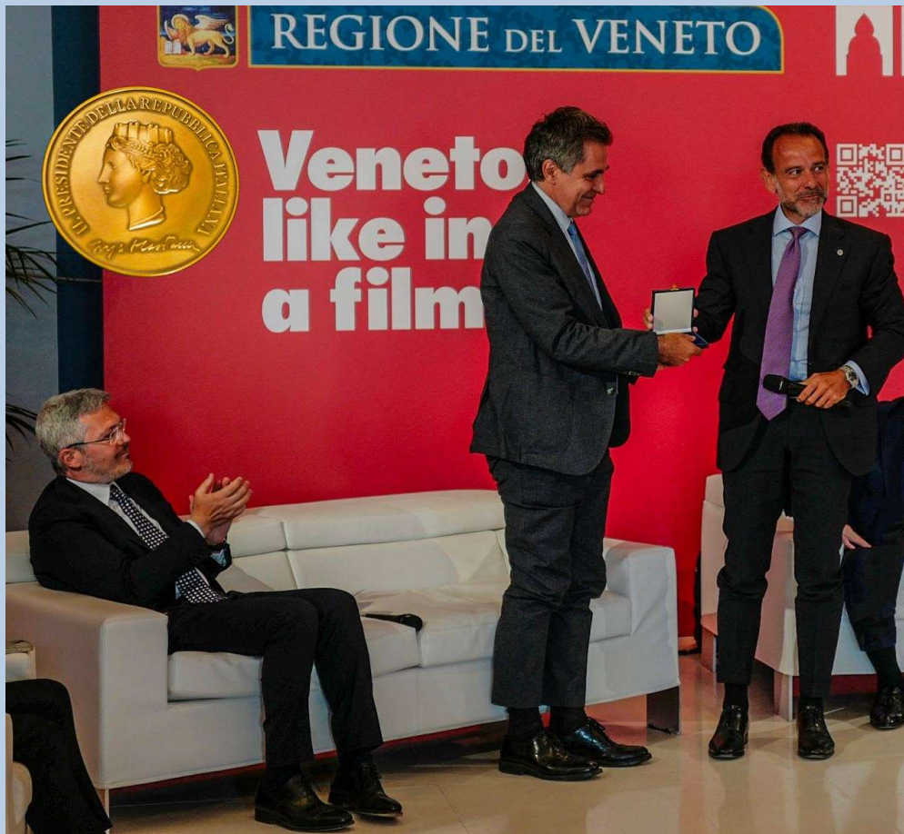
79 th Venice International Film Festival - Presentation of the Metamorfosi project described in a 15' short film made by ADM and Venezia Ginko Film.