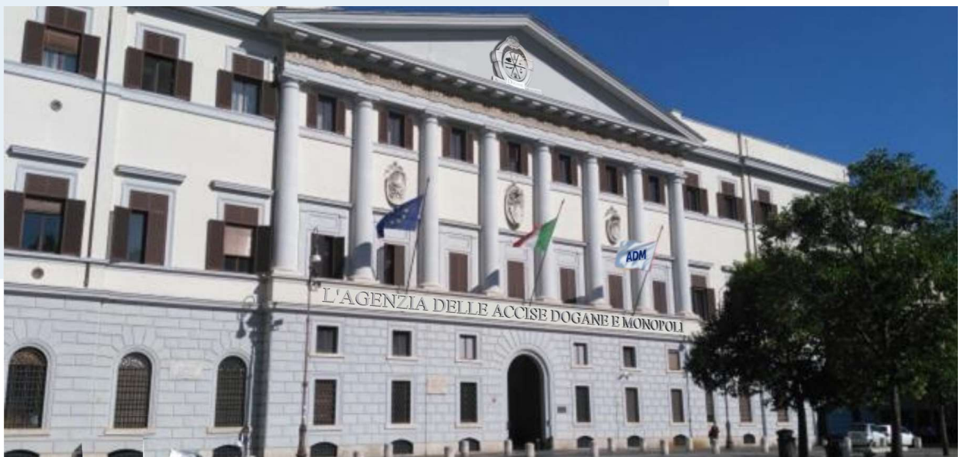
Directorate General Building Piazza Mastai 12, Rome