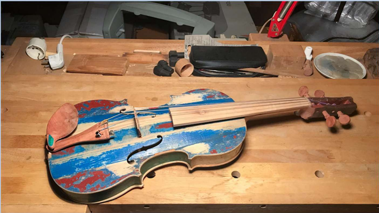
The first wooden violin “Violino del Mare” (“Violin from the sea”), created with wood from boats bringing migrants to Lampedusa island.

This initiative was awarded the Representation Medal by the President of the Italian Republic for its high social and legality value and was also described in a short film presented at the 79 th Venice International Film Festival and at the Rome Film Fest 2022.