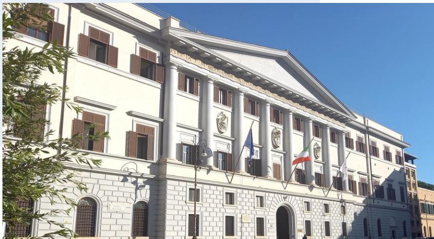
Directorate General Building Piazza Mastai 12, Rome