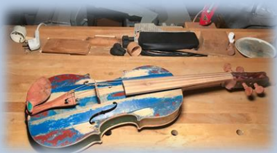
The first wooden violin “Violino del Mare” (“Violin from the sea”), created with the wood from boats used by migrants to reach Lampedusa.

«METAMORFOSI» is an initiative based on the idea of inclusion, implemented in collaboration with the Casa dello Spirito e delle Arti (House of the Spirit and Arts) and with the Department of the Penitentiary Administration. Once the judicial authority has released seized migrant sunken boats, ADM disposes said boats in compliance with the law and then provides inmates from different penitentiaries with wood from such boats.